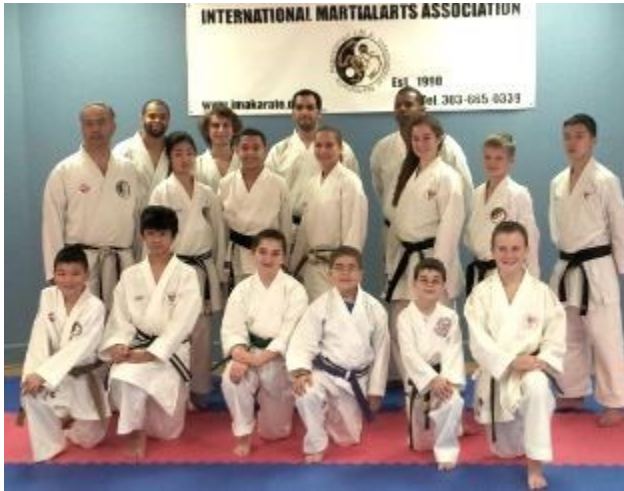
Elite Training Participants